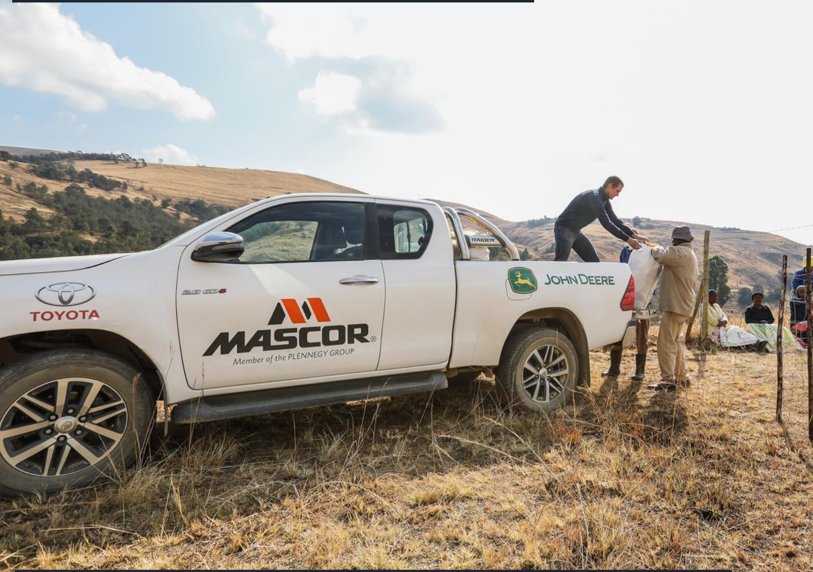
The Mascor Toyota Hilux being put to good use during the maize harvest in Mphithini in July