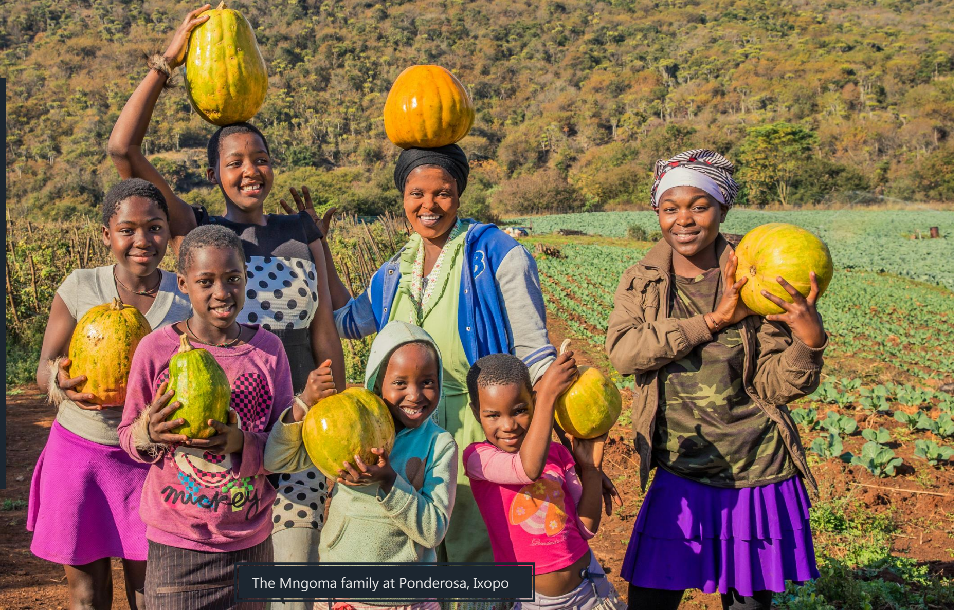
The Mngoma family at Ponderosa, Ixopo

Being a Public Benefit Organisation, we can supply donors with an 18A Tax Certificate for contributions over R500.